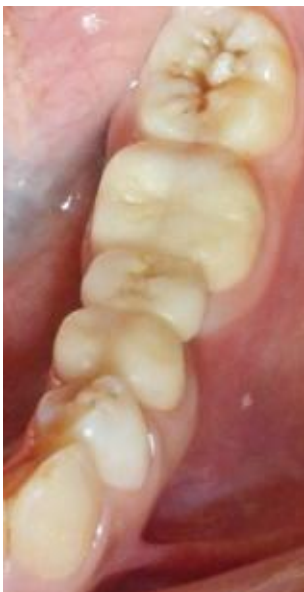
Figure 17. zirconium bridge preparation to restore tooth 46.

Additionally, a zirconium bridge preparation was done to restore the missing tooth number 46 (Figure 17) and a titanium implant was placed also to restore tooth number 36. This treatment was chosen according to amount of bone as one of the key requirements for dental implant treatment is having enough bone, which is a solid reliable base to anchor the implant. 5 This was found in the left area and a successful dental implant was placed (Figures 18-21).