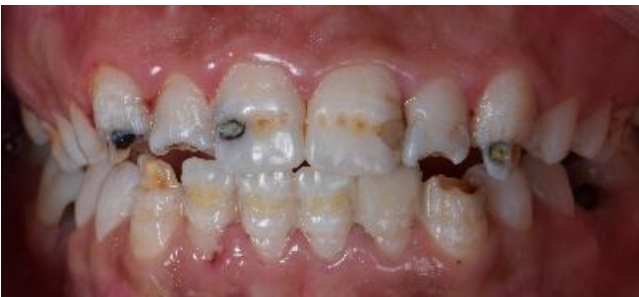
Figure 1. carious lesions in 13 to 23& 33 to 43

Clinical examinations showed multiple hypoplastic and carious lesions varying in size and depth from tooth number 13 to 23 & from 33 to 43. (Figure 1)