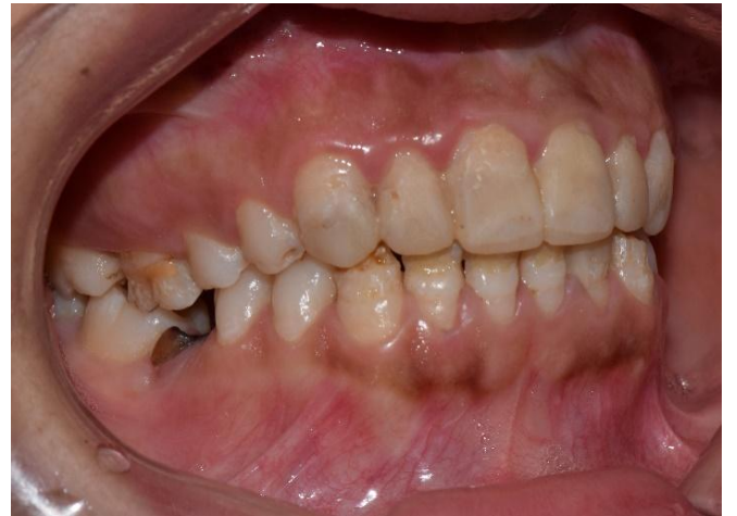
Figure 8. diagnostic wax up right sideview.