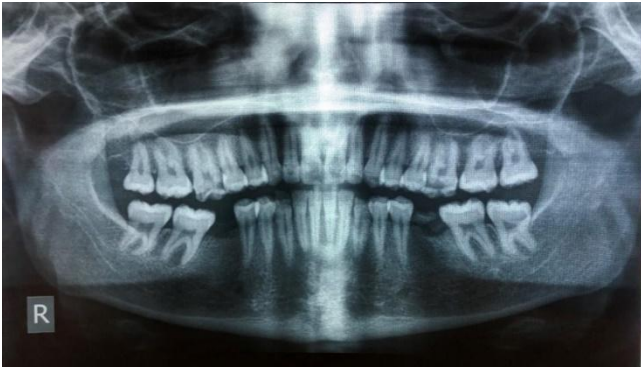
Figure 4. panoramic x-ray showing remaining roots.

Regarding the lower left molar area, cone beam CT was requested to show the depth, width and quality of the bone and the surrounding vital structures for an implant placement surgery of tooth number 36. (Figure 5)