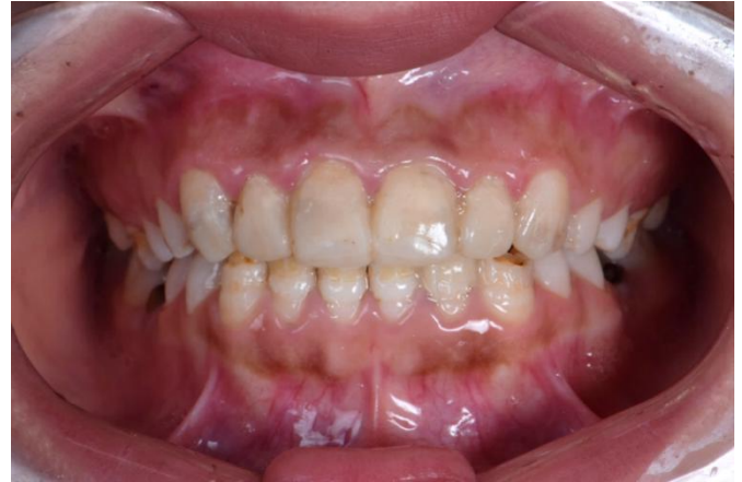
Figure 7. diagnostic wax up frontal view.

Firstly, periodontal therapy was performed. Scaling and root planning were done to reinforce the gingival health and improve the oral hygiene. Diagnostic wax-up and a motivational mockup were fabricated as a simulation of the final result and motivation of the patient (Figures 7, 8 & 9).