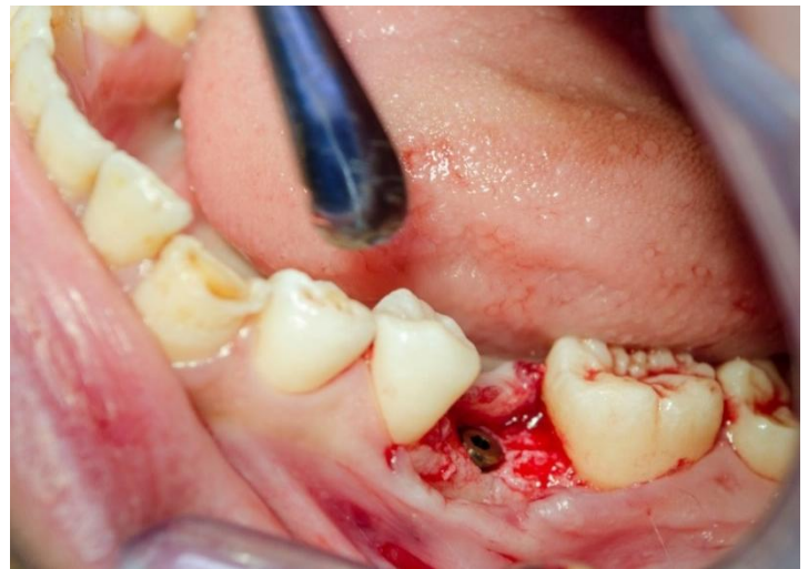
Figure 19. placement of implant.