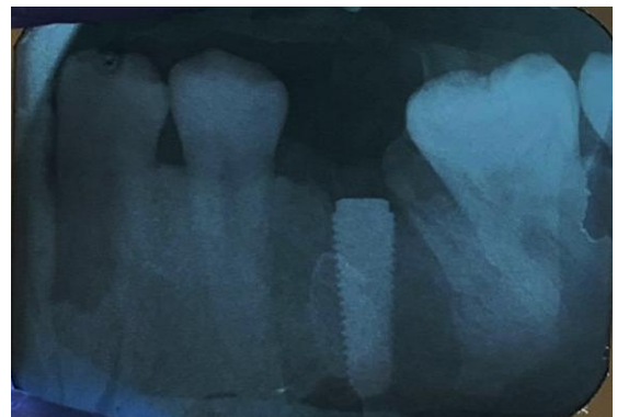
Figure 21. x-ray image showing the implant after placement.