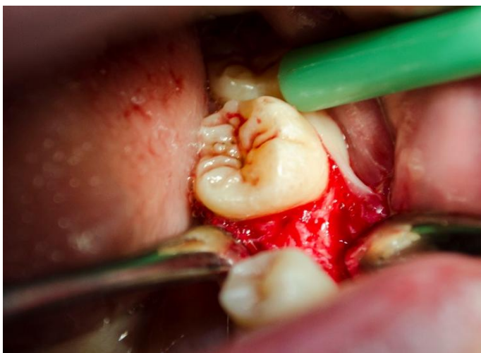
Figure 18. flap preparation for implant placement.

After 3 months follow up, osseointegration was successfully achieved and the implant was ready to be loaded. Thereby, a premolar-shaped zirconia crown was placed as the space was insufficient to restore a molar-shaped abutment. This was achieved by a closed tray impression technique to transfer the implant-abutment relation to the dental lab (Figures 22-26).