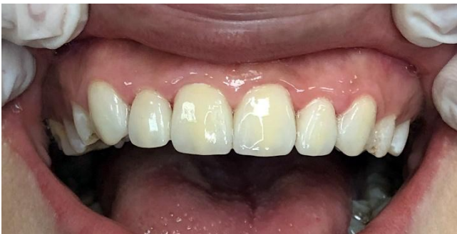
Figure 12. E-max crowns of maxillary anterior teeth.

Furthermore, endodontic treatment was done for teeth number 16 & 26 followed by post and core followed by E-max crowns as well (Figures 13 & 14).