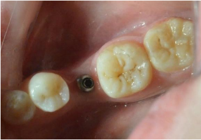
Figure 22. implant after 3-month osteointegration.