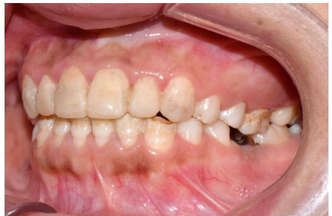
Figure 9. diagnostic wax up left side view.