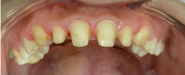
Figure 10. crown preparation for maxillary anterior teeth.

The mandibular remaining roots in the molar area were removed atraumatically. A restorative treatment was then carried out to remove the carious lesions and E-max crowns were placed on the maxillary anterior teeth (Figures 10-12).