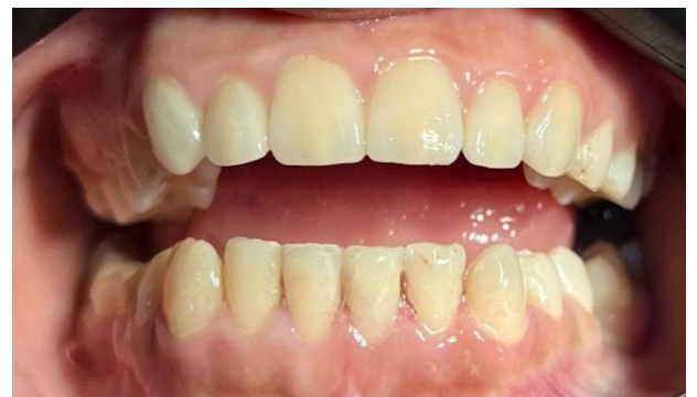
Figure 16. final composite restoration for lower anterior teeth.