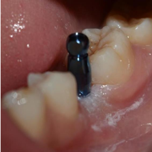
Figure 24. preparing the implant for closed tray impression.