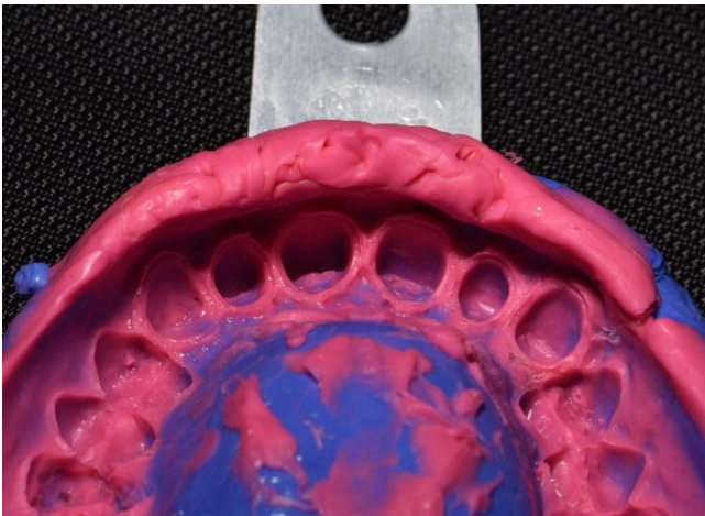
Figure 11. Final impression of prepared maxillary anterior teeth.