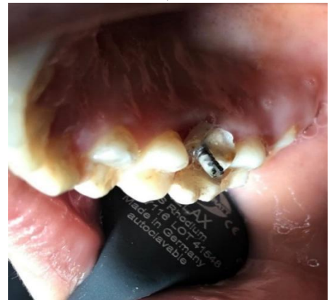
Figure 14. post placement for tooth number 16.

Regarding the lower anterior teeth, direct composite veneers was the plan of choice as a conservative treatment (Fig. 15 & 16).