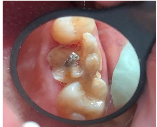
Figure 13. post placement for tooth number 26

Furthermore, endodontic treatment was done for teeth number 16 & 26 followed by post and core followed by E-max crowns as well (Figures 13 & 14).