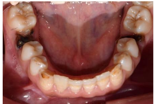
Figure 3. retained roots in 36 & 46

The hypoplastic lesions resulted from a severe fever she suffered at young age according to her medical history. Moreover, the gingiva was mildly edematous and showed signs of inflammation caused by her inadequate oral hygiene. Upon periodontal examination, mild marginal gingivitis was found with localized periodontitis at teeth number 16 & 26 where the probing depth was increased up to 3.5mm due to lack of proper oral hygiene and hypofunction at these areas. Preoperative intraoral photographs were recorded from different aspects using Nikon D5100 DSLR camera.