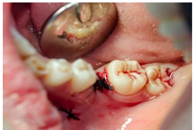
Figure 20. closing the wound by sutures.