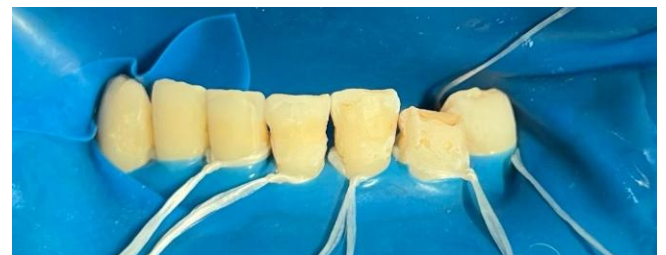
Figure 15. rubber dam placement for lower anterior teeth.

Regarding the lower anterior teeth, direct composite veneers was the plan of choice as a conservative treatment (Fig. 15 & 16).