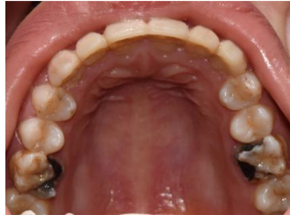
Figure 2. badly decayed 16 & 26

Posteriorly, badly decayed 16 & 26, and retained roots in 36 & 46 were found. (Figures 2&3)