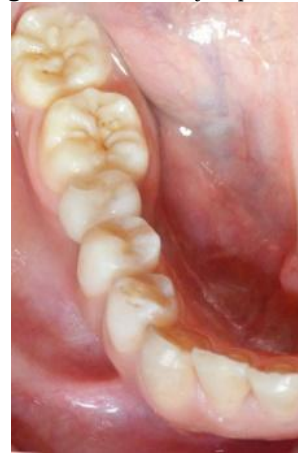
Figure 26. placement of the restored crown for tooth 36.

On the contrary, the lower right molar area had insufficient bone volume which prevented the placement of a dental implant and hence a zirconium bridge was placed 5 . Alongside the dental intervention, the patient was instructed to follow a calcium rich diet in addition to iron injection for treating severe anemia. A three month follow up to monitor the restorations and the prosthesis was advised.