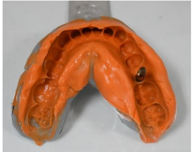
Figure 25. closed tray impression.