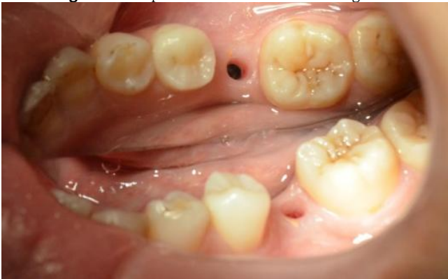
Figure 23. removal of the abutment to prepare for impression.